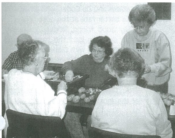
Easter Bunny helpers stuffing eggs

Thank you to all the members who donated cookies, who donated candy for the eggs, who helped fill the eggs, and to all who brought their children and grandchildren and, finally, to all of our guests.