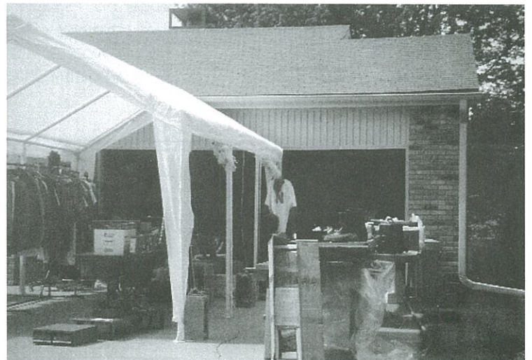
Let it rain!